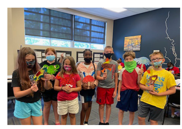
Marine Animals Puppet Show